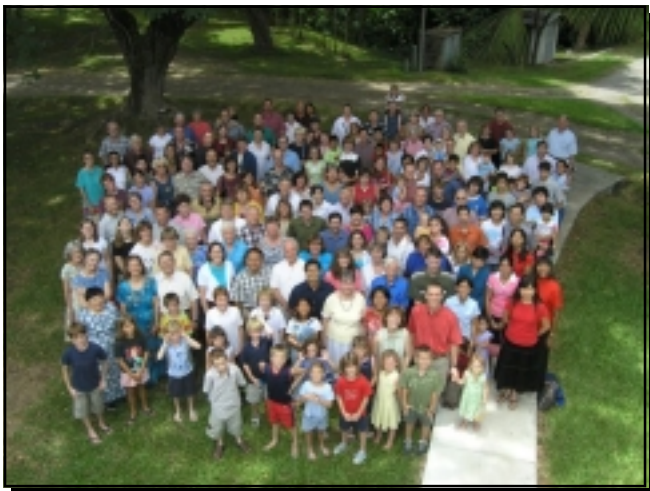
Conference Group Picture, 2006

Every two years most of the members of WBT and SIL who work here in the Philippines gather together to elect a director and executive committee. We listen to reports, discuss new ideas, pray together, and vote on various policies. This year our Conference was held for the first time right here in Bagabag. We were involved in some of the preliminary preparations. At the top of this page is the banner the two of us designed and had made for our Conference Hall. (The actual size was 3 feet high by 18 feet long.)