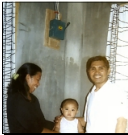
Fuse box for new electric service